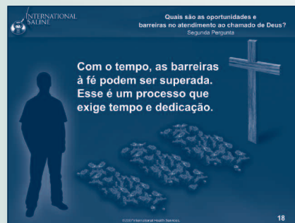
International Saline slide in Portuguese shows the need for patience as God's Spirit is at work.

Translated International Saline materials are motivating participants to take action, particularly e-mails sent in the indigenous language following a training session.