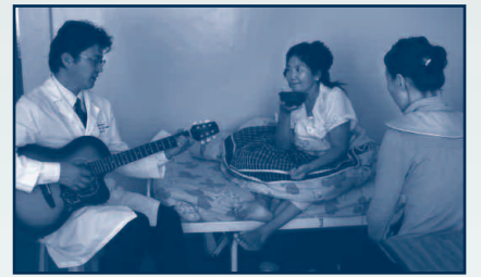
ACTION: Doctor in Mongolia brings ministry in music with his delivery of healthcare. Principle: "Act with permission, sensitivity and respect."