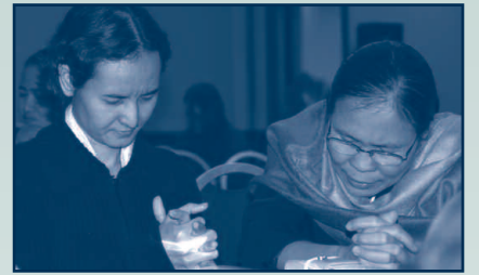
PRAYER: Participants in the HCFI Asia Pacific Conference commit their plans of action to prayer during International Saline training. Principle: "It all begins with prayer."

The United Kingdom experienced a landmark event for trainers who are transitioning to the new International Saline materials. That meeting brought together seasoned and novice trainers from throughout the United Kingdom, including nurses eager to start training their colleagues. The training debuted in Paris in 2009, and a session in Spain provided impetus to plan a Training of Trainers session early in 2010. In Sweden, interest was cultivated for the ministry in Norway and Denmark, while in Switzerland participants cast a vision to reach European countries represented in its official language groups of French, German and Italian.