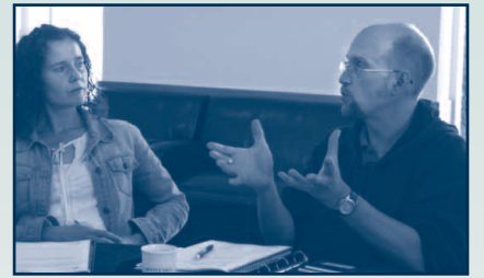
VISION: In Coventry, England, members of Nurses Christian Fellowship International, discuss training implications for their setting. Principle: "Develop an action plan."