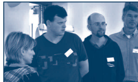
During training in Coventry, England, the demonstration of barriers encountered in patients solidifies the concept that people go through a series of micro-decisions on the journey to faith in Christ.