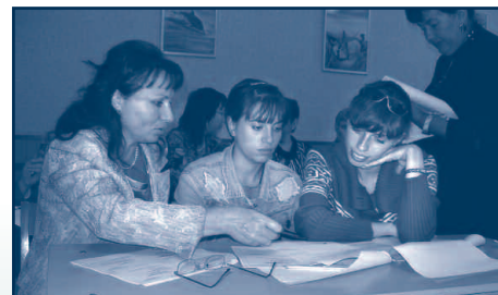
In Tula, Russia (south of Moscow), participants work together on a training activity geared toward skills building, also laying a sound foundation to put principles into practice after the training. Small groups formed during training are encouraged to continue their connection as prayer and accountability partners afterward.